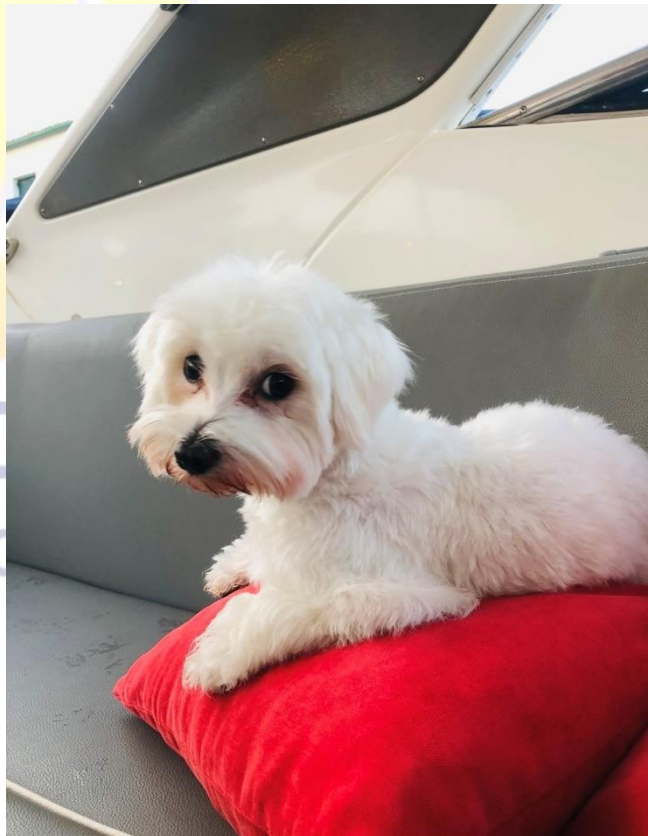
Nalla relaxing on her favorite pillow 🐾

Dogs are not like people, and sometimes, due to their age or their feelings, they might not be able to control their needs. We suggest that you make sure that your dog is properly potty trained, plan short sailing trips so the dog can go out for a walk, and as mentioned above, have some dog diapers along. Please note that the dog should not pee anywhere on the yacht, not even on hard surfaces inside our outside the yacht, except on their dog diapers (as an emergency solution). If you bring along your cats, a frequently cleaned cat litter box on the exterior space of the yacht would be enough.