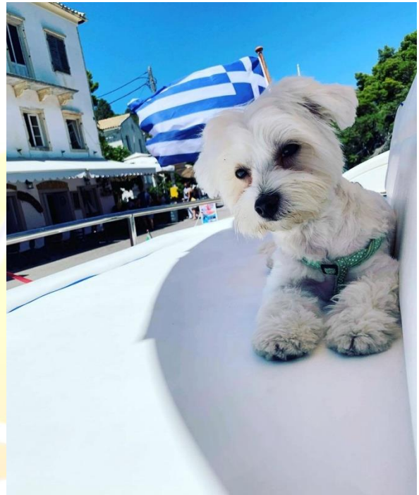
Richie sailing the Ionian Islands 🇬🇷

Our primary aim is not only to keep our clients happy, but to make them feel like home, and home is always where our pet is. In order for all of us to be prepared for your charter, there are some simple steps we can suggest you follow: